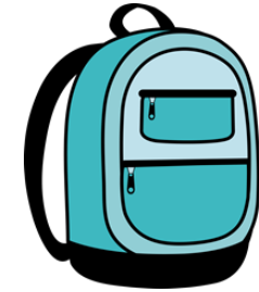
A small bag for my reading book