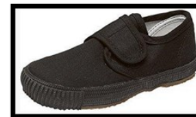
A pair of black plimsolls (to be kept in school)

Don't forget to make sure your name is in everything!